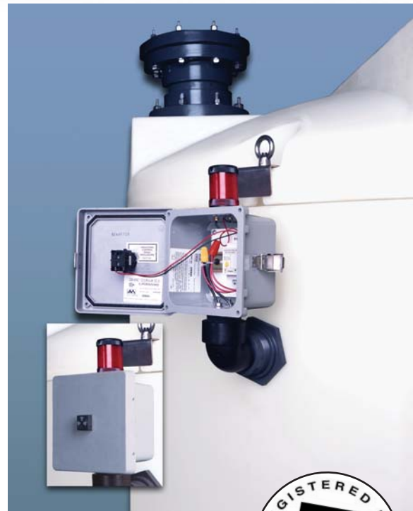
Interstitial leak detection system with audible and visual alarms

An On/Off switch has been purposely left off the system so that when problems occur they cannot be ignored.